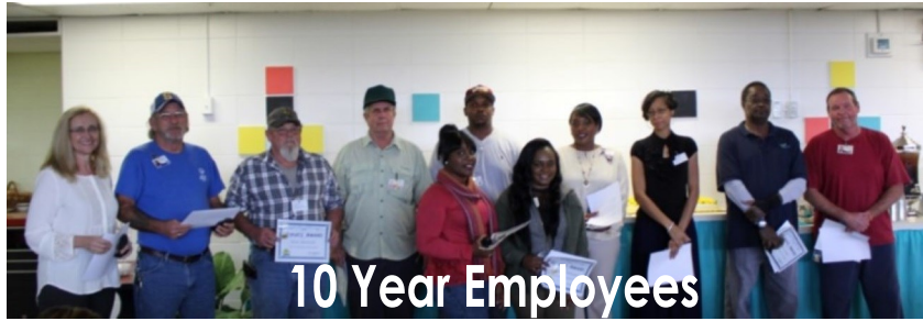
10 Year Employees