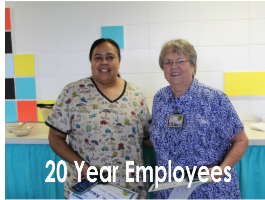
20 Year Employees