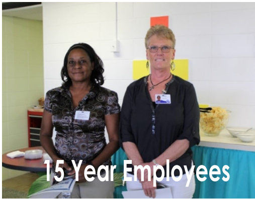
15 Year Employees