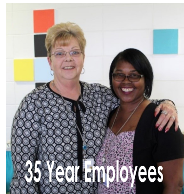
35 Year Employees