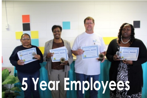
5 Year Employees