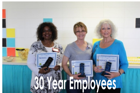
30 Year Employees