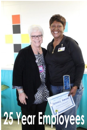
25 Year Employees